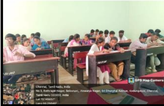
Chennai, Tamil Nadu, India No.3, Bathnaghi Nagar, Selavoyal, Alawarya Nagar, Sri Dhurgahal Avenue, Kodungalur, Chennai, Tamil Nadu 600051, India Lat 13.145937° Long 80.256848°