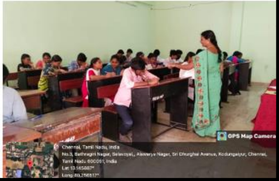
Chennai, Tamil Nadu, India No.3, Bathnaghi Nagar, Selavoyal, Alawarya Nagar, Sri Dhurgahal Avenue, Kodungalur, Chennai, Tamil Nadu 600051, India Lat 13.145937° Long 80.256817°