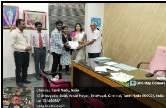
Chennai, Tamil Nadu, India 17, Bhoopathy Salai, Andal Nagar, Selavayal, Chennai, Tamil Nadu 600051, India Lat 13.146068° Long 80.256825°

Thiruthangal Nadar College observed National Science Day on Feb 28, marking Sir C.V. Raman's 1928 discovery of the Raman effect. A quiz competition, jointly organized by Maths, Chemistry, and Plant Biology Depts., saw 17 teams vie for cash prizes and certificates.