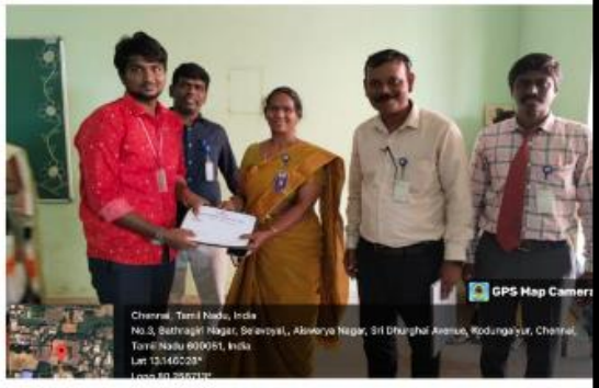
Chennai, Tamil Nadu, India No.3, Bathnaghi Nagar, Selavoyal, Alawarya Nagar, Sri Dhurgahal Avenue, Kodungalur, Chennai, Tamil Nadu 600051, India Lat 13.146033° Long 80.256173°