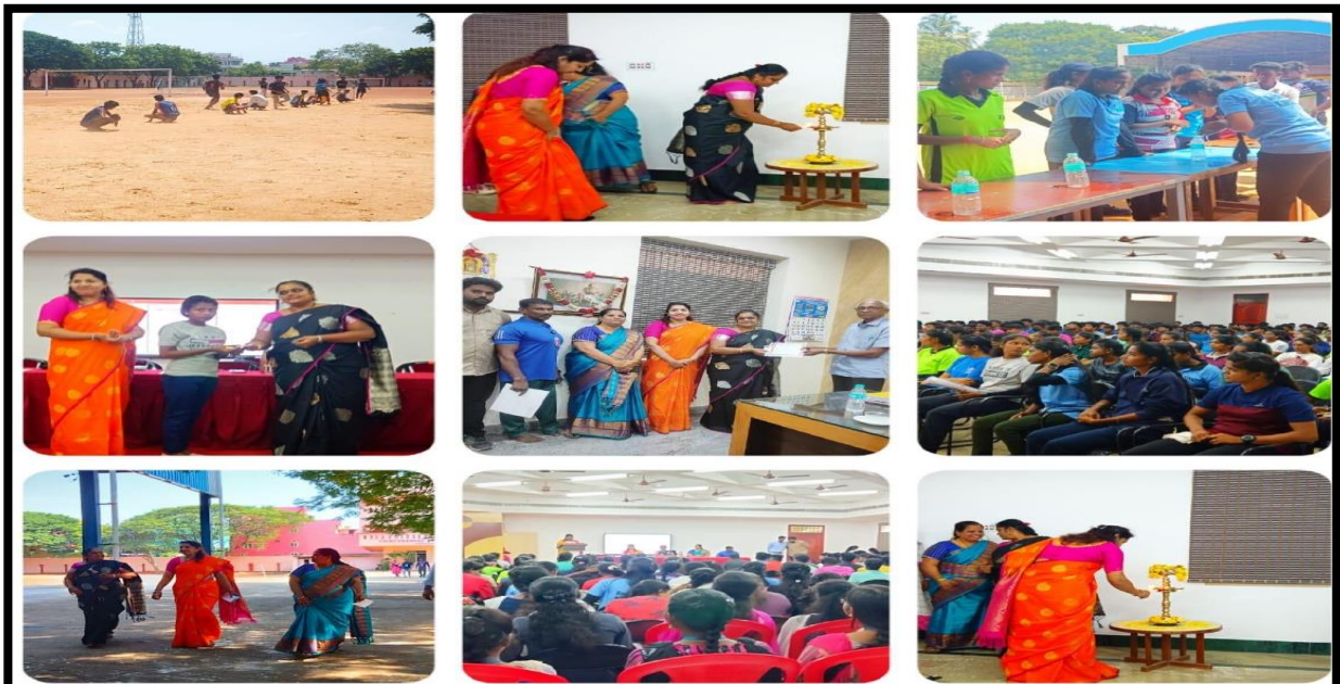
National sports day 2023