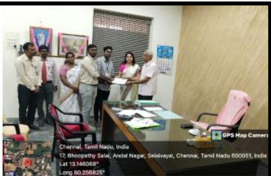
Chennai, Tamil Nadu, India 17, Bhoopathy Salai, Andal Nagar, Selavayal, Chennai, Tamil Nadu 600051, India Lat 13.146068° Long 80.256825°