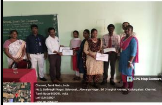
Chennai, Tamil Nadu, India No.3, Bathnaghi Nagar, Selavoyal, Alawarya Nagar, Sri Dhurgahal Avenue, Kodungalur, Chennai, Tamil Nadu 600051, India Lat 13.145893° Long 80.256198°