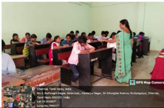
Chennai, Tamil Nadu, India No.3, Rathnagiri Nagar, Selalvayal, Alwaraya Nagar, Sri Dharghal Avenue, Kodungalur, Chennai, Tamil Nadu 600051, India Lat 13.146924° Long 80.256825°