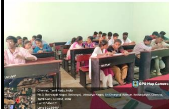
Chennai, Tamil Nadu, India No.3, Rathnagiri Nagar, Selalvayal, Alwaraya Nagar, Sri Dharghal Avenue, Kodungalur, Chennai, Tamil Nadu 600051, India Lat 13.146924° Long 80.256825°