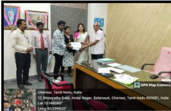
Chennai, Tamil Nadu, India 17, Bhoopathy Salai, Andal Nagar, Selalvayal, Chennai, Tamil Nadu 600051, India Lat 13.146966° Long 80.256825°

Thiruthangal Nadar College observed National Science Day on Feb 28, marking Sir C.V. Raman's 1928 discovery of the Raman effect. A quiz competition, jointly organized by Maths, Chemistry, and Plant Biology Depts., saw 17 teams vie for cash prizes and certificates.