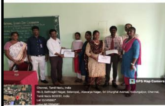
Chennai, Tamil Nadu, India No.3, Rathnagiri Nagar, Selalvayal, Alwaraya Nagar, Sri Dharghal Avenue, Kodungalur, Chennai, Tamil Nadu 600051, India Lat 13.146924° Long 80.256825°