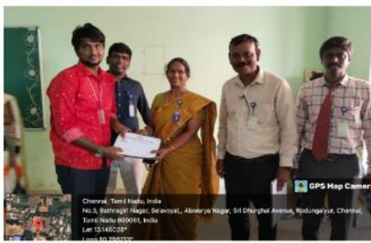
Chennai, Tamil Nadu, India No.3, Rathnagiri Nagar, Selalvayal, Alwaraya Nagar, Sri Dharghal Avenue, Kodungalur, Chennai, Tamil Nadu 600051, India Lat 13.146924° Long 80.256825°