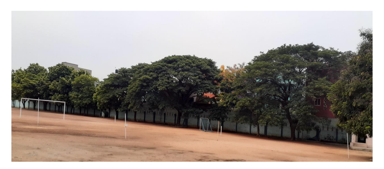
Shaded walkway at TNC

plants. Being in the middle of densely urban area, it is vital to maintain the green cover in the campus. Students and faculty are active participants in numerous plantations drives in the nearby localities.