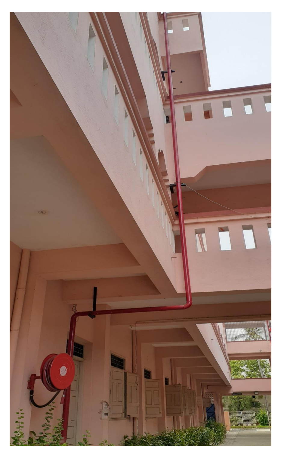
Fire hose in the building