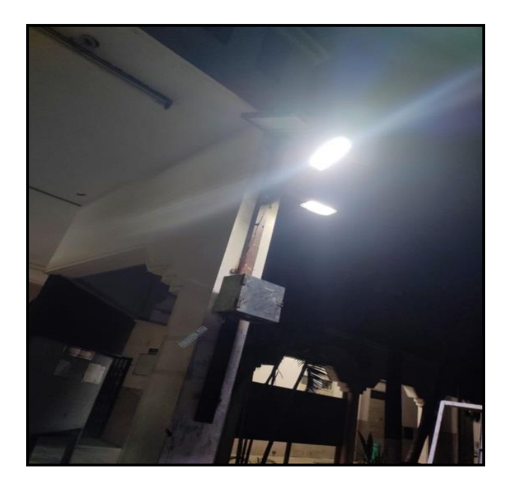
Solar Light in front of Principal's office

"The Solar Street Light" was implemented in continuation of the "Energy Audit", by the Department of Physics. This is an attempt to initiate the resourcefulness of conservation of energy in our campus.