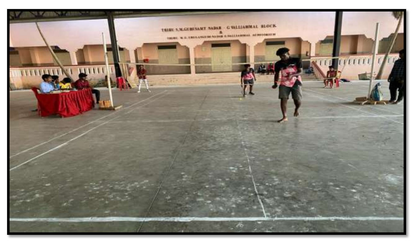
Ball Badminton Court - 2 No.s, 24x12 Sq.Mts