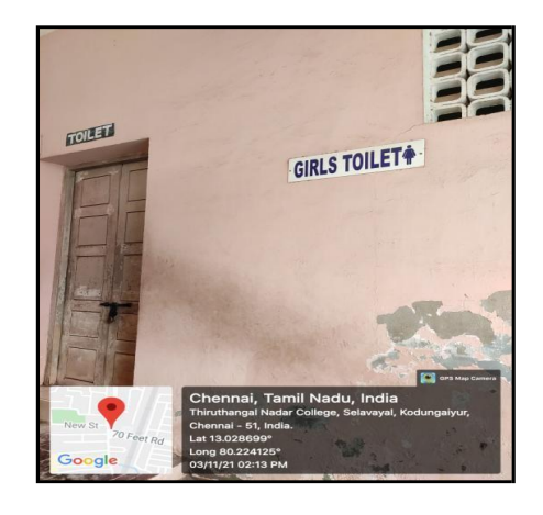
Principal THIRUTHANGAL NADAR COLLEGE SELAVAYAL, CHENNAI-600 051.