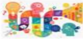
ED - Calculus - Integral