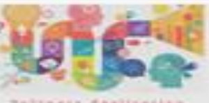
Statistics - Probability