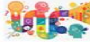
Information system Management