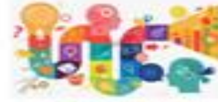
Calculus - Integral