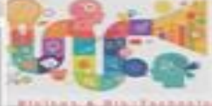
Second, Third & Bio-Technology