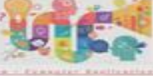
ED - Calculus - Probability