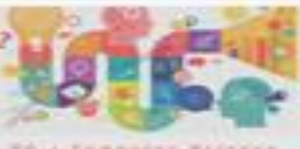
ED - Calculus - Integral