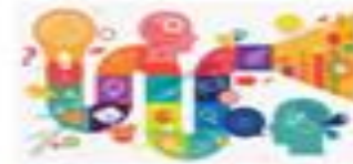
First, Second & Bio-Technology