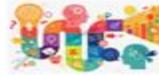
Statistics - Probability