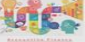
Statistics - Finance