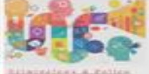
Statistics & Finance