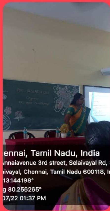
Chennai, Tamil Nadu, India 1c, Anna Avenue, Selaivayal Rd, Sri Dhurghai Avenue, Selaivayal, Chennai, Tamil Nadu 600118, India Lat 13.144198° Long 80.256265° 29/07/22 01:37 PM