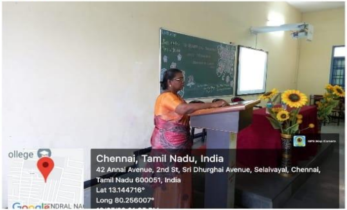
Chennai, Tamil Nadu, India 42 Anna Avenue, 2nd St, Sri Dhurghai Avenue, Selaivayal, Chennai, Tamil Nadu 600051, India Lat 13.144716° Long 80.256007°