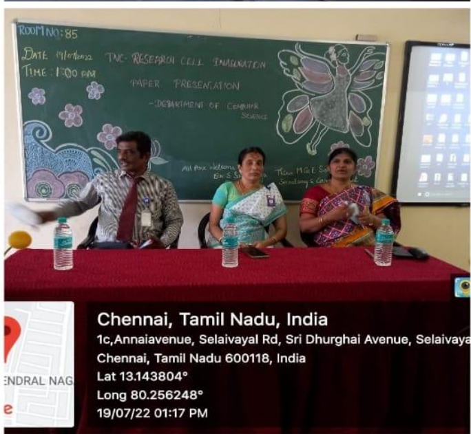
Chennai, Tamil Nadu, India 1c, Anna Avenue, Selaivayal Rd, Sri Dhurghai Avenue, Selaivayal Chennai, Tamil Nadu 600118, India Lat 13.143804° Long 80.256248° 19/07/22 01:17 PM