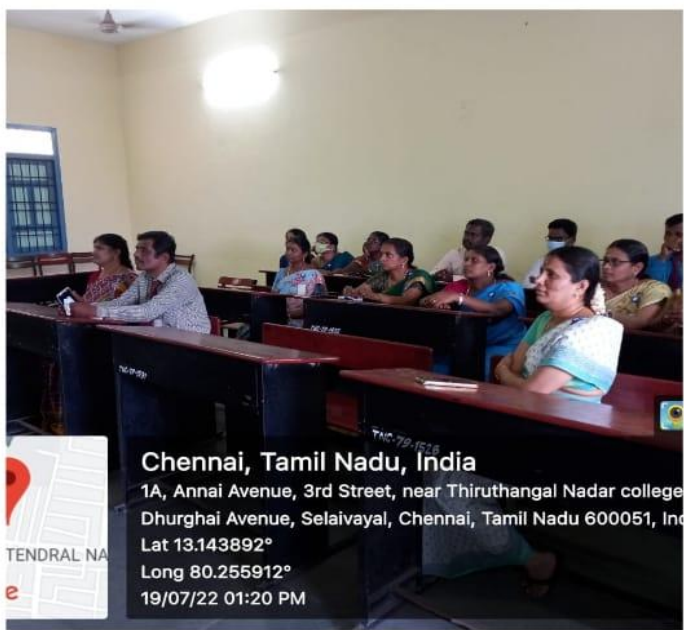
Chennai, Tamil Nadu, India 1A, Anna Avenue, 3rd Street, near Thiruthangal Nadar college Dhurghai Avenue, Selaivayal, Chennai, Tamil Nadu 600051, India Lat 13.143892° Long 80.255912° 19/07/22 01:20 PM