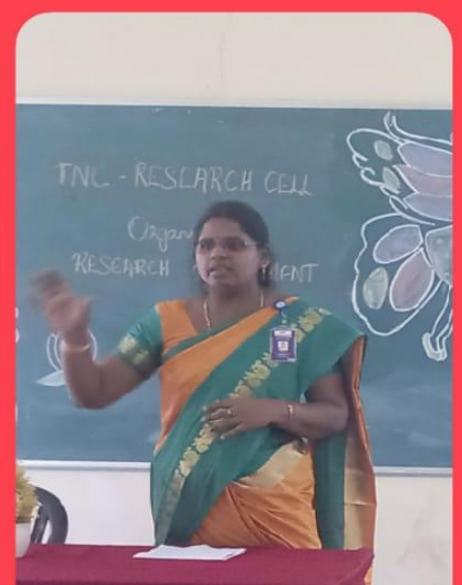
Chennai, Tamil Nadu, India 1c, Anna Avenue, Selaivayal Rd, Sri Dhurghai Avenue, Selaivayal, Chennai, Tamil Nadu 600118, India Lat 13.143944° Long 80.256265° 29/07/22 01:36 PM