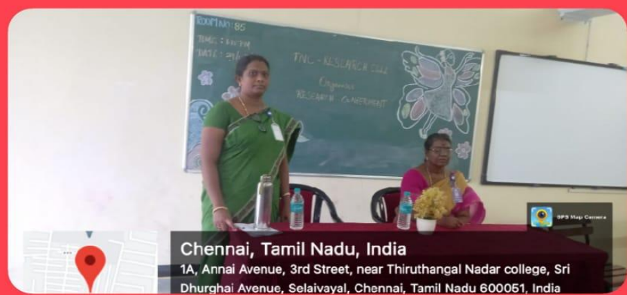
Chennai, Tamil Nadu, India 1A, Anna Avenue, 3rd Street, near Thiruthangal Nadar college, Sri Dhurghai Avenue, Selaivayal, Chennai, Tamil Nadu 600051, India