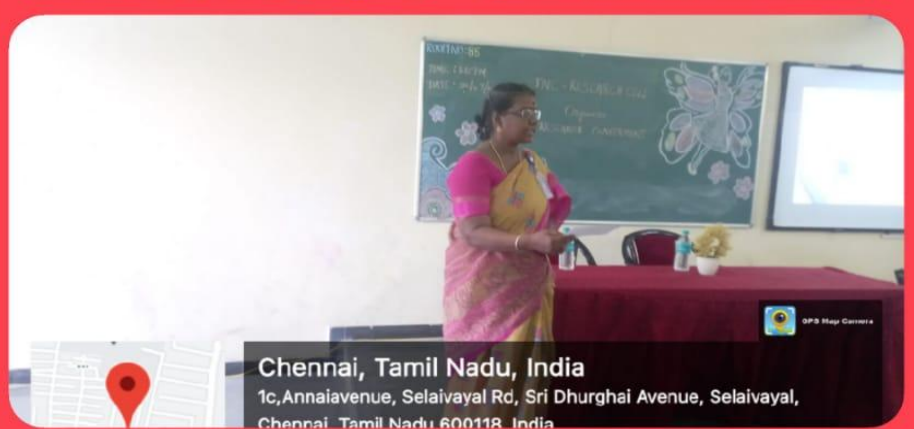
Chennai, Tamil Nadu, India 1c, Anna Avenue, Selaivayal Rd, Sri Dhurghai Avenue, Selaivayal, Chennai, Tamil Nadu 600118, India