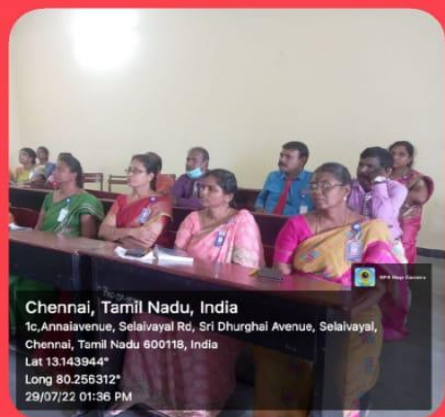
Chennai, Tamil Nadu, India 1c, Anna Avenue, Selaivayal Rd, Sri Dhurghai Avenue, Selaivayal, Chennai, Tamil Nadu 600118, India Lat 13.143944° Long 80.256312° 29/07/22 01:36 PM