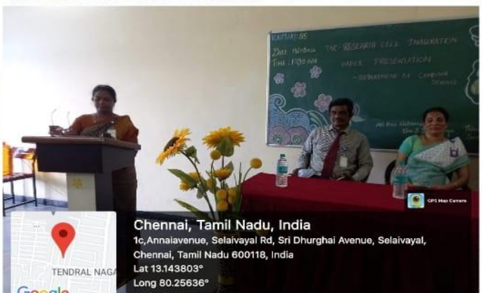
Chennai, Tamil Nadu, India 1c, Anna Avenue, Selaivayal Rd, Sri Dhurghai Avenue, Selaivayal, Chennai, Tamil Nadu 600118, India Lat 13.143803° Long 80.25636°