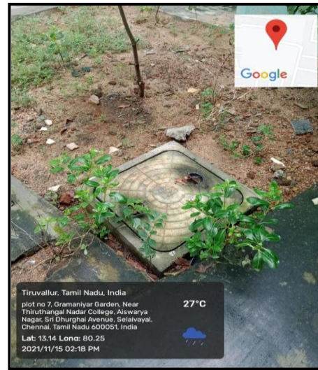
Open Well and Bore Well