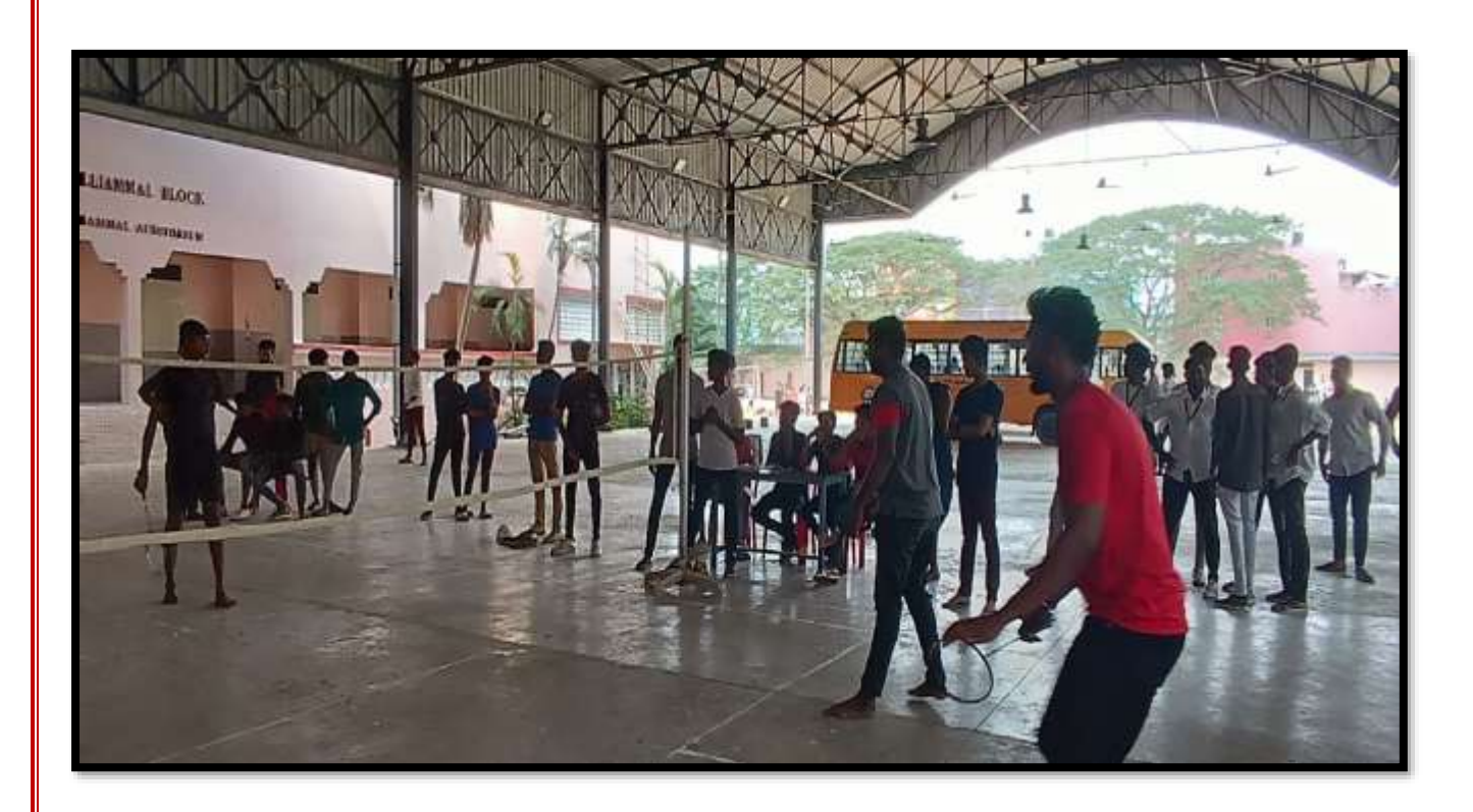
Ball Badminton Court - 2 No.s, 24x12 Sq.Mts